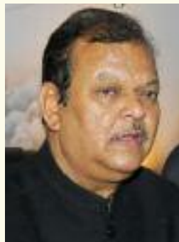
Subodh Kant Sahay

In the recent cabinet reshuffle, Subodh Kant Sahay has been made Minister of Tourism. He replaces Kumari Selja who has been relieved of tourism portfolio. She however retains Housing and Urban Poverty Alleviation along with additional charge of Culture. Vayalar Ravi has taken over Civil Aviation from Praful Patel.